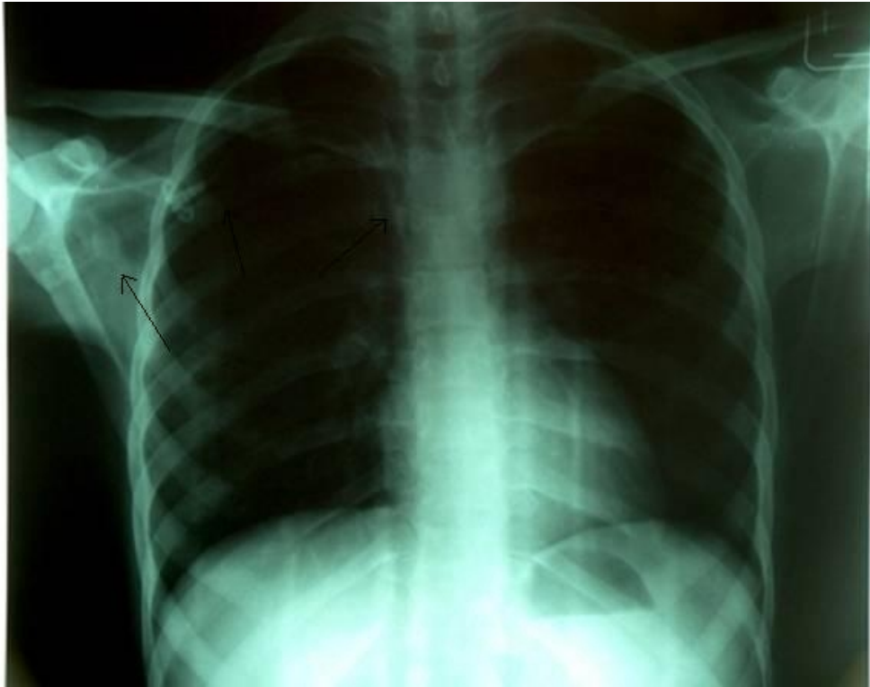
Fig 2. A posterior chest radiograph was obtained and showed a percutaneous central venous line placed in the right brachiocephalic vein and superior vena cava, corresponding to the zones of abnormal radiotracer activity in the right infraclavicular and parasternal areas of whole body bone scan. Abnormal scan findings were interpreted then as radiotracer adhesion to the catheter walls.