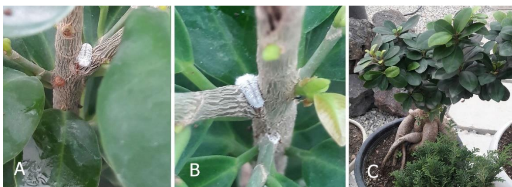
Fig. 3. A & B, Planococcus kraunhiae adult female; C, Ficus retusa (Moraceae)

Field characters (Fig. 3 A, B): Adult female with body long oval; white mealy wax covering body; dorsomedial area bare; marginal wax filaments, most relatively short, straight (Figs. 3, A, B). Male not observed.