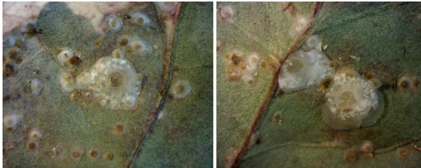
Fig. 1. Immature and mature female covers of Aspidiotus hedericola Leonardi

Distribution: This species is distributed mostly European countries in Palaearctic region (Garcia Morales et al. , 2016). It was probably introduced to Iran with ornamental plants.