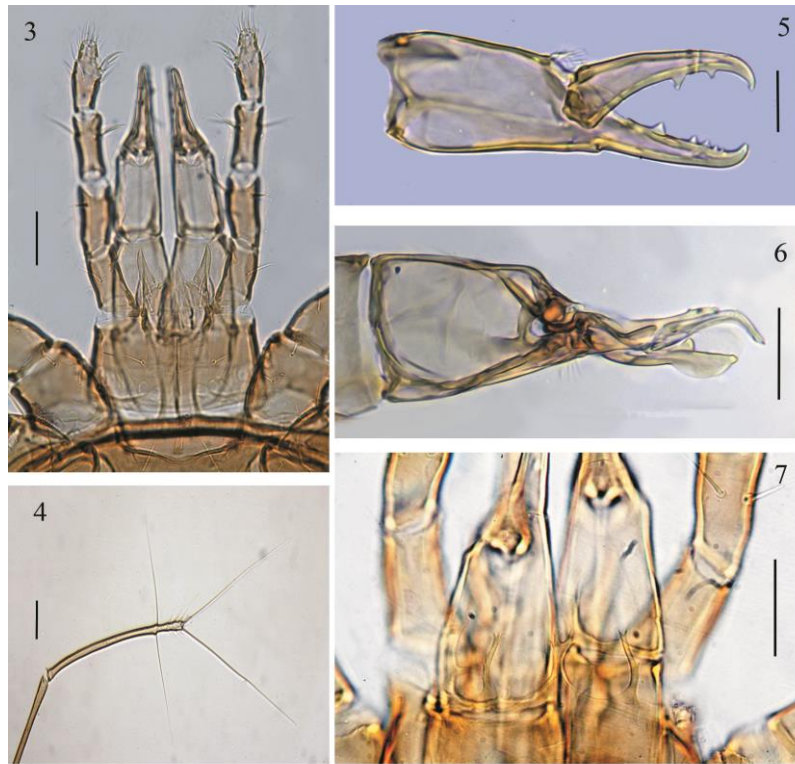
Figs 3–7. Podocinum sagax Berlese. 3. Hypostome; 4. Tarsus I; 5. Female chelicera; 6. Male chelicera; 7. Epistome. Scale bar: 50 µm for 3; 200 µm for 4; 25 µm for 5; 25 µm for 6; 40 µm for 7.