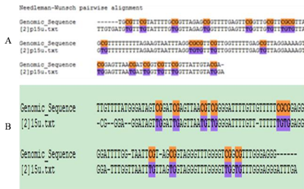
Figure 2. Sequencing comparison of methylation products and non-methylation products in the 5' end of P 15 gene promoter region (A). Sequencing comparison of methylation products (orange marker) and non-methylation products (purple marker) in DAPK gene of 1 MM patient (B)

synthesized. The sequences of primers were as follows: P 15 gene: upstream primer, 5'-ATGCGCG-AGGAGAACAAG-3'; downstream primer, 5'-CTCCG-GAAACGG TTGACTC-3'; amplified fragment length, 143bp. DAPK gene: upstream primer, 5'-AGAGTTT-GTCGCTCCTGAGATAGT-3'; downstream primer, 5'-TGCTAACGTTTCTTGCTT AGTGTG-3'; amplified fragment length, 139bp. SOCS 1 gene: upstream primer, 5'-TATTA CTTCCTGGAACCATGTG-3'; downstream primer, 5'-TCAAGAGGTGAGAAGGGGTCT-3'; amplified fragment length, 127bp. The GAPDH gene was used as the internal standard: upstream primer, 5'-AGTCAACGGATTTGGTTCGTATT-3'; downstream primer, 5'-AACCATGTAGTTGAGGTCAATGAAG-3. The reverse transcription quantitative polymerase chain reaction (RT-qPCR) was conducted on CFX96 Touch PCR detection system (Bio-Rad Laboratories, CA, USA), with using Platinum SYBR Green qPCR SuperMix-UDG Kit (Bio-Rad Laboratories, CA, USA). GAPDH was used as the internal reference. The PCR steps were as follows: pre-denaturation, 2 min at 50 °C; denaturation, 2 min at 95 °C; annealing, 15 sec at 95 °C; elongation, 30 sec at 60 °C. Above steps were performed for 40 cycles. The expression amount was presented by cycle-threshold. The relative mRNA expression values were expressed as fold increase or decrease relative to GAPDH.