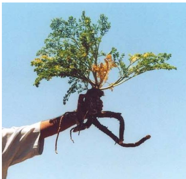
Figure 1. The plant Ferula persica

inflammatory and cancer chemopreventive), and galbanic acid (26) (anti-tumor and anti-angiogenic) have been reported from Ferula species.