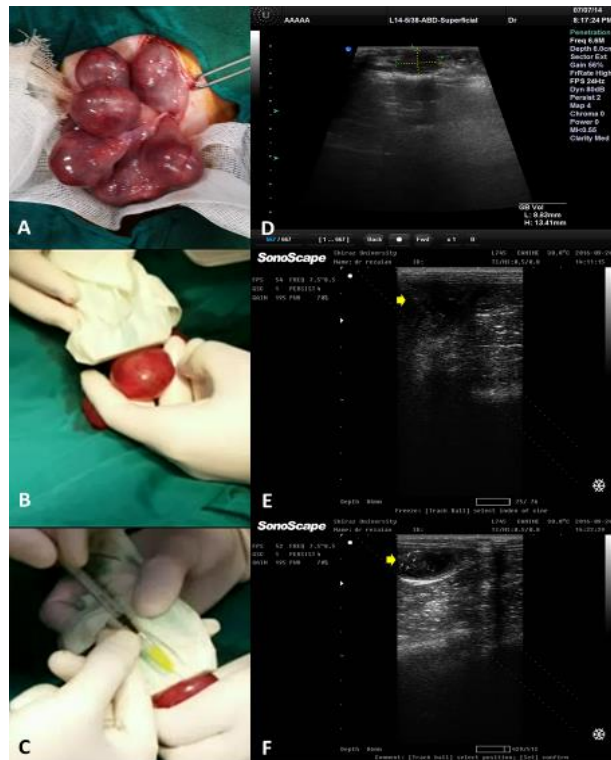
Figure 1. Intrauterine injection of human Wharton jelly-derived mesenchymal stem cells (hWJ-MSCs) into the rabbit fetuses. A) Ventral midline laparotomy to expose rabbit uterine horn. B and D) determining the exact position of the peritoneal cavity by ultrasonography and measurement of the crown-rump length of the fetuses. C, E, and F) needle insertion and injection of hWJ-MSCs in the peritoneal cavity of the fetus (arrows)

Rabbits generate their antibody repertoire first by VDJ gene rearrangement as early as gestation day 14 in fetal liver (29). According to the onset of the immune system developing time in rabbits, in utero xenotransplantation was performed at day 14 of pregnancy. Eight rabbits were selected for cell injection (Table 1). The fetuses of those rabbits that were not injected were selected as positive controls. The other 2 pregnant rabbits served as negative controls. Rabbits were anesthetized with intramuscular injection of xylazine (1 mg/kg, Alfasan, Worden, Holland) and ketamine (2 mg/kg, Alfasan, Worden, Holland) and postured in a dorsal position. Using a transabdominal ultrasound with a 3.5-MHz curved array probe, presence, position, and viability of the fetuses were determined, and crown-rump length was measured to confirm the gestational age (Figure 1) (30). Exposing the uterus from an abdominal wall incision, a 24-gauge spinal needle was inserted through the uterine wall into the amniotic cavity and then into the peritoneal cavity and liver of the fetuses under continuous ultrasound guidance by using the freehand technique (Figure 1) (31, 32). After confirmation of the appropriate positioning of the