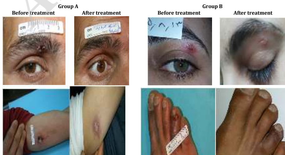
Figure 3. The size of CL lesion. Group A: test group treated with ozonated olive oil and glucantime. Group B: control group treated with glucantime alone.

Although ozone therapy requires the gaseous form to be more effective, it has been proposed that the base oils such as olive oil, during the ozonation processes can engage O_3 in the form of a stable ozonide (35). The