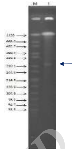
Figure 1. S1-PFGE. Lane M, DNA Marker; lane 1, strain AB34

Only OXA-58(599bp) and NDM-1(720bp) were detected