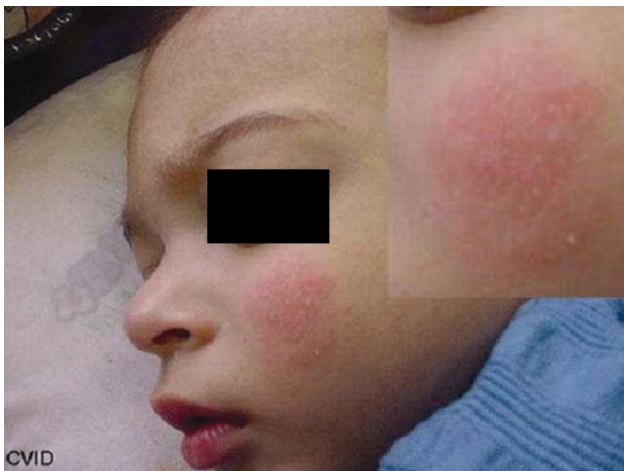
Figure 2. Dermatitis on the face of a child with CVID.