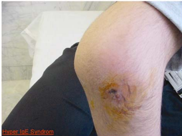
Figure 1. Recurrent furunculosis in a patient with hyper IgE syndrome.

In our study those PIDs affecting antibody production were more frequent (Table 2) Similar to some other studies. 5-8 The skin is one of the organs in which manifestations of an immunodeficiency is reflected rather early in life. 3,9 31.8% of our patients had skin manifestations at the onset of their disease. In one study by Hermazewski and Webster in 21% of cases, skin lesions were the first presenting symptoms in patients with primary antibody deficiencies. 10 The high frequency of cutaneous alteration in PIDs and their easy access for observation and biopsy have been generally overlooked. The fact that a high proportion of patients with PIDs, have cutaneous alterations makes a complete dermatologic examination mandatory. 2 In pediatric patients with failure to thrive, chronic refractory systemic manifestations often present in other family members, recurrent cutaneous infections unresponsive to adequate therapy, atypical forms of eczematous dermatitis or unusual features such as extensive telangiectasia, erythroderma or silvery hair should arouse the suspicion of PID and prompt specialized immunologic consultation should be made. 40.5% of our patients had dermatologic alterations and many of them had more than one skin lesion. In study of