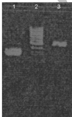
Figure 2. Analysis of the expression of IL-13 mRNA. Lane 1: \beta -actin as 215 bp band; Lane 2: Ladder (100 bp); Lane 3: Expression of IL-13 mRNA as 450 bp band.