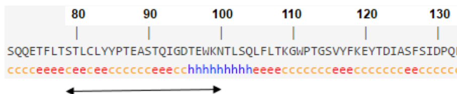
Figure 2. The results of the secondary structure of predicted B and T cells prediction epitope STLCLYYPTEASTQIGDTEWKN (22 aa) comprised of alpha-helix (h) 22.72%, beta sheets (e) 36.4% and random coil (c) 40.9%.

The results of the secondary structure of predicted B and T cells prediction epitope STLCLYYPTEASTQIGDTEWKN (22 aa) comprised of alpha-helix (h) 22.72%, beta sheets (e) 36.4% and random coil (c) 40.9 (Figure 2). The result of the tertiary (3D) structures of predicted B and T cells prediction epitope modeled by the Swiss model. The predicted epitope STLCLYYPTEASTQIGDTEWKN (22 aa) of surface glycoprotein VP7 (G) of humans is illustrated with Magenta color in Figure 3.