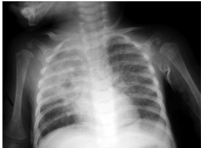
Fig. 2. An 18-month-old child with pulmonary TB. Note consolidation in RUL with air-bronchogram and interstitial lung marking more prominent in the left side.

Eight patients (26.7%) presented with manifestations of musculoskeletal, gastrointestinal, genitourinary and central nervous system involvement instead of pulmonary symptoms (Table 1). Some radiographic patterns are depicted (Figs. 1-4).