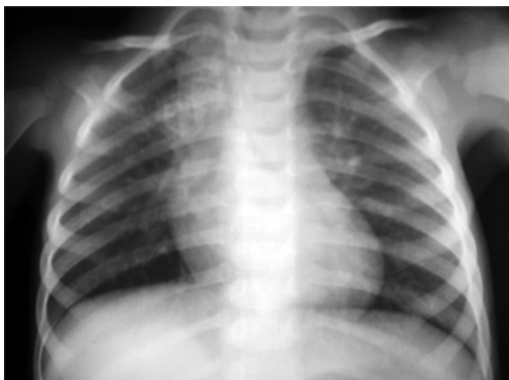
Fig. 3. A 2-year-old child with proved TB. Note calcified right paratracheal and left hilar lymphadenopathies.

Most pulmonary tuberculosis cases seen in infants are due to primary infection. It begins when the respiratory secretion of a patient with TB is inhaled and reaches the lung alveoli which then causes parenchymal inflammation. 2,13,16 The primary focus is the initial inflammation which is produced by localized alveolar consolidation. 2 This primary focus of TB is usually not visible on CXR but may rarely progress to involve a segment or an entire lobe. 16,17 Infection then spreads to the central lymph nodes from the primary focus via draining lymphatic vessels, (appearing as a linear interstitial pattern on chest radiographs) and