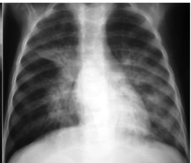
Fig. 4. A 4-year-old child with pulmonary TB. Bronchopneumonic infiltration in both lung fields and right hilar lymphadenopathy are noted.