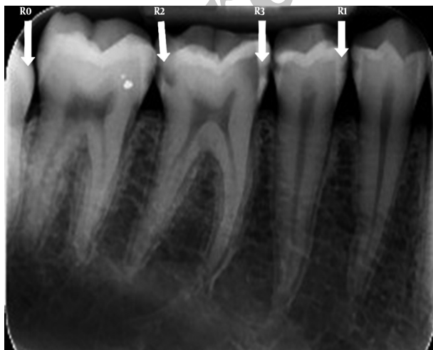
Figure 2. Classification of caries according to the depth of caries in radiography. Sound (R0), restricted to the enamel (R1), reaching the dentino-enamel junction, reaching the outer half of the dentin (R2) and the inner half of the dentin (R3)

Moreover, CCD Dixi3 was applied in the present study with a spatial resolution rate more than Dixi2 (16 lp/mm);