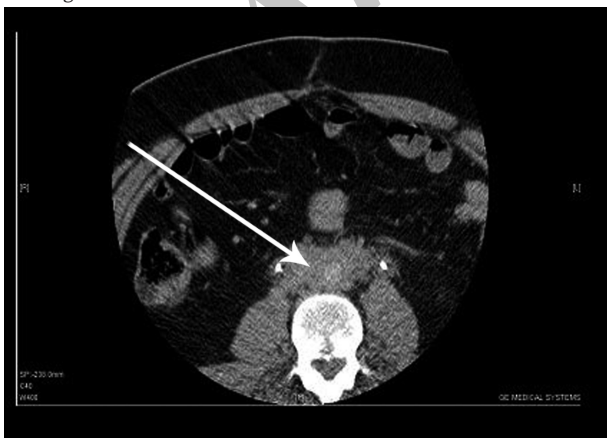
Figure 1. A 40-year-old man presenting with pain in the flank and abdomen together with flank tenderness

CT scan without contrast shows a soft tissue mass (arrow) which is located in the retroperitoneal area at the level of the fourth and fifth lumbar vertebrae.