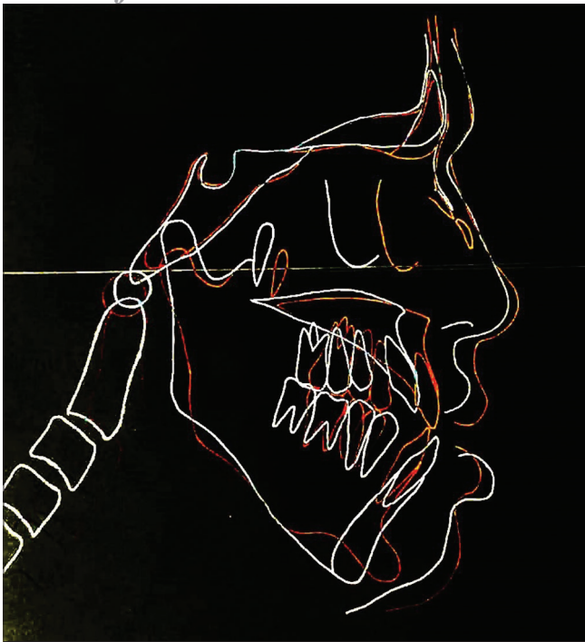
Figure 5: Cephalometric tracing superimposition on skull base showing obvious improvement in the occlusal relationship and skeletal discrepancy as well as soft-tissue parameters. (white lines for preoperative tracing and red lines for postoperative one). Slight mandibular forward rotation is noted in condylar and dental areas.

nasal dorsum augmentation, and genioplasty can result in highly successful outcomes both for patient and surgeon as well as many positive effects on patient's self-confidence and social aspect of his/her life; thus, such an approach is highly recommended, especially if the patient is financially affordable.