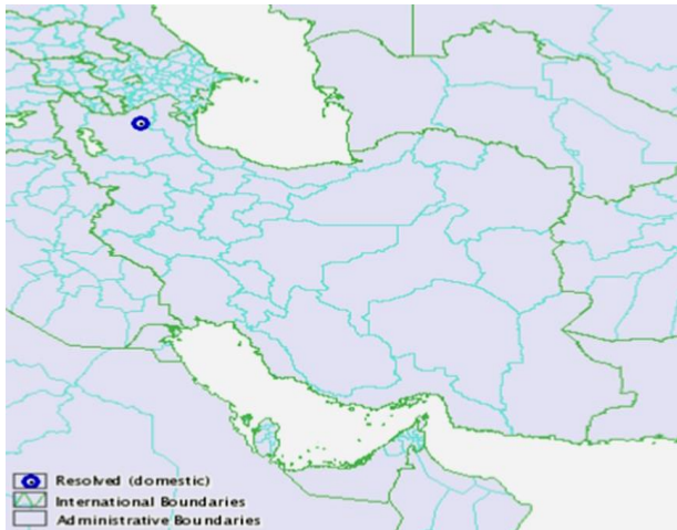
Fig. 1. The location of outbreaks in Iran