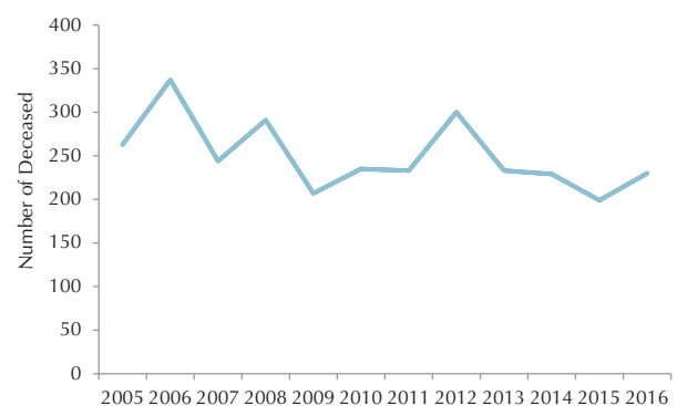
Figure 1. Frequency of the Deceased Population Because of Accidents and Driving Accidents Leading to Death in Chaharmahal and Bakhtiari Province During 2005 to 2016.

in 2008 and 2012, and the fewest were in the years 2009 and 2015 (Figure 1). During the last 12-year period, the rate of accidents has decreased significantly (Spearman's rho = -0.65, P=0.022 ). In terms of the distribution of the months of the year, the highest percentage of accidents belonged to the end of August and the beginning of September while the lowest percentage was related to the end of February and the beginning of March (Figure 2). In addition, the frequency of accidents leading to death indicated a significant change based on the month and the year ( P<0.001 ). Further, the frequency of deaths caused by accidents represented a significant difference when compared based on gender and marital status ( P<0.001 ). Based on the results, the highest frequency of deaths caused by accidents belonged to married men. Furthermore, the frequency of accidents leading to deaths based on age demonstrated a significant difference ( P<0.001 ), in which the highest frequency belonged to the age range of 21-25 while the lowest frequency was related to the age range of 11-15 and 80 and over. The frequency of deaths caused by accidents also had a significant difference when compared based on the level of education ( P<0.001 ). According to the data, the highest frequency was related to illiterate groups whereas the lowest frequency belonged to people with master's degrees and higher (Table 1). As regards