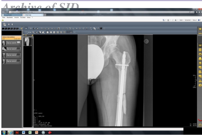
Figure 2. Teleradiological transmission via TKmed®.

pertaining to the appropriateness and consequences of medical advice. Generally, doctors will recommend seeking a colleague's opinion if a patient has concerns. This either leads to further options or the elimination of concerns if both medical statements are identical. Some specialists offer specific teleconsultation hours, so that patients do not have to come in person, which is advantageous for sparsely populated and less developed regions (Figure 2).