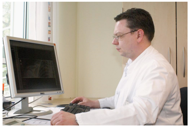
Figure 3. Second Opinion

Patients, established specialists, and rehabilitation facilities should be able to upload their own radiological images to the communication platform and send it to the respective recipient using any web-enabled computer. This would empower patient communication, enabling a treatment plan based on an equal partnership. Furthermore, direct and comprehensive communication enhances optimal patient safety as well as prompt treatment. With this system, the patient can save time and effort by transmitting images and documents directly online to the respective physician, avoiding waiting times, unnecessary travel, and redundant tests (radiation exposure). It also facilitates the hospital workflow, which is another benefit for patients. Simultaneously, healthcare costs are reduced, but quality of care is improved.