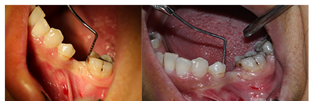
Figure 1. Measurement of dental papilla height in the mesial and distal aspects before surgery.

Descriptive statistics were reported using tables and analyzed using chi-squared and Mann-Whitney