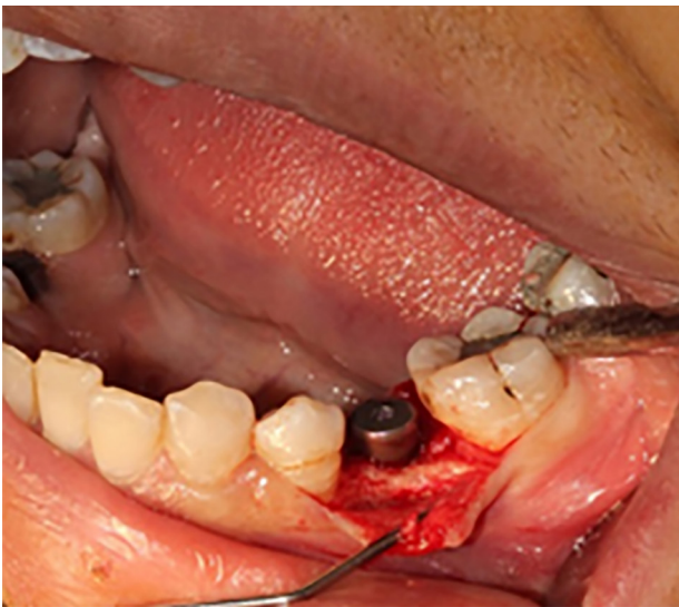
Figure 2. The healing abutment is placed after implant placement (one-stage surgery).

tests and independent t-test. The level of significance was set at P < 0.05 .