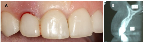
Figure 1. (A) The preoperative clinical and (B) CBCT views

immediate provisionalization was decided upon as an ideal position was not possible; therefore, it was decided to augment the apical bone concavity before tooth extraction and immediate implantation. Prior to the surgical process, informed consent was obtained from the patient.