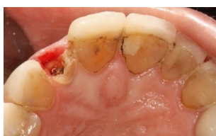
Figure 2. The fractured maxillary lateral incisor.

After surgery, amoxicillin, 500 mg (q8h for seven days), gelofen, 400 mg (q6h for seven days), and