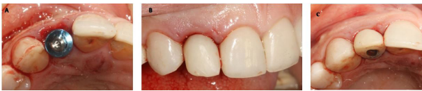
Figure 5. (A) Placement of an Osseotite implant in the extraction socket. Immediate provisional composite-based crown from the frontal (B) and occlusal views (C)

A regular follow-up was performed every month. After four months, the site healed without any complications, and the periapical radiograph showed no bone loss and radiolucency around the implant. The provisional restoration was removed, and an open tray impression was taken using the putty/wash technique (Imprint™, 3M, Minnesota, United States) (Figure 7). The implant abutment torqued to 25 N/cm 2 , and a definitive screw-retained metal-ceramic restoration was delivered (Figure 8).