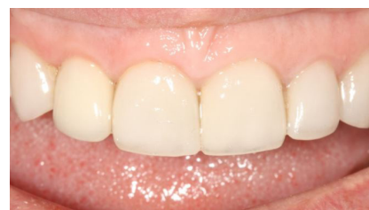
Figure 8. A definitive screw-retained metal ceramic restoration was fabricated 4 months after implant placement.

In the esthetic zone, provisional restorations have several benefits. Assessment of esthetic, phonetic, and occlusal functions before the fabrication of final implant restorations and establishment of a natural and esthetic peri-implant mucosal tissues and interdental papilla are some of the advantages of provi-