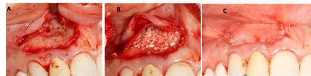
Figure 3. (A) The mucoperiosteal flap reflected to expose the apical bone concavity. (B and C) Guided bone regeneration procedure.

0.2% CHX mouthwash (twice daily for a week) were prescribed. The patient was asked to return at two-day, one-week, and one-month intervals after surgery for postoperative assessment.