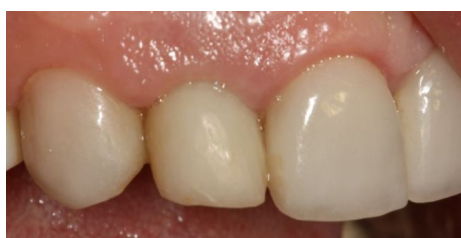
Figure 6. Clinical view 4 months after implant placement.

Different studies have indicated that immediate implant placement is a successful and predictable treatment. 7-10 Implants placed in the extraction socket exhibited high survival and success rates comparable to those for implants placed in healed sites. 11 Immediate implant placement and provisionalization provide optimal esthetic by preserving the hard and soft tissue architecture. 12,13 However, placing an implant in the fresh extraction socket cannot prevent physiologic modeling/remodeling that occurs