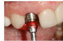
Figure 7. An open-tray impression coping was used for the final impression.

in the socket wall. Width and height changes of the buccal plate are more pronounced than those in the lingual plate. 14-16