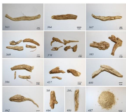
Figure 1. Market samples of Radix Behen Albi purchased from different herbal markets of Iran (refer to table 2 for sample details)

Extracted DNA was purified using a GE Illustra GFX™ PCR DNA and Gel Band Purification kit following the manufacturer's instructions (GE Healthcare, Buckinghamshire, UK). Four barcode regions, nrITS (ITS1-5.8S-ITS2) as a nuclear marker, trnL-F spacer, matK and rbcL as plastid markers were amplified using polymerase chain reaction (PCR) method. The primer pairs, their sequences and PCR conditions are given in table 1. PCR amplification was performed in 50 µL reactions