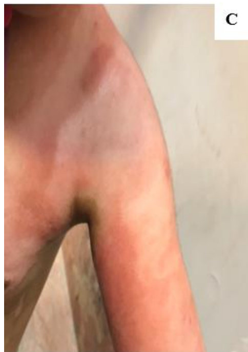
Fig.2: (A & B) Multiple papular and nodular lesions on the shoulder and arm burn scars in a 32 month-old girl; (C) 4 weeks later lesions disappear without any scar.