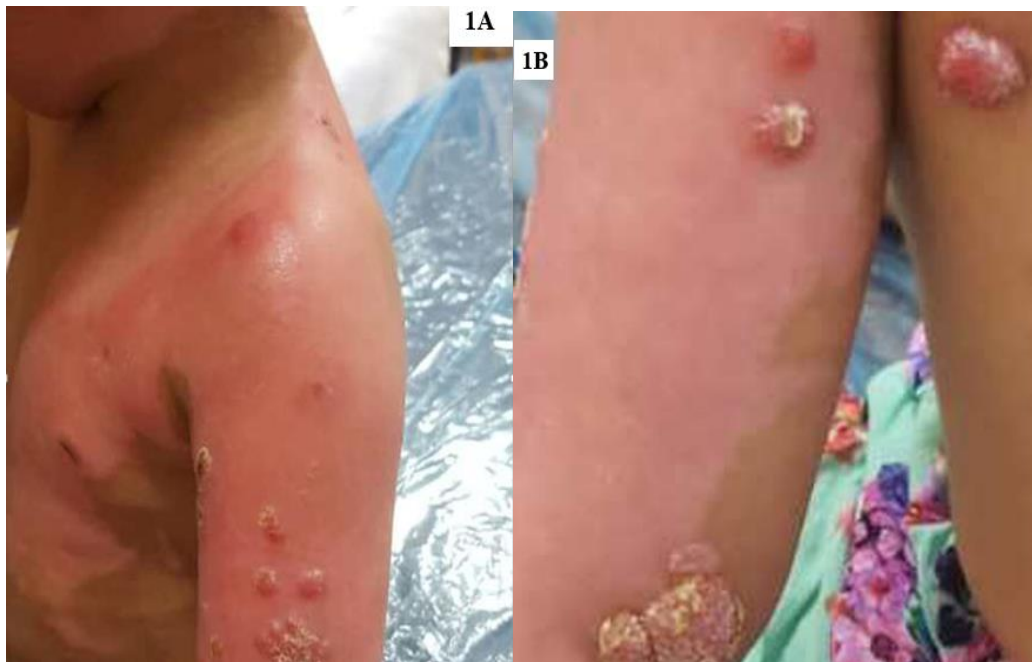
Fig.1 (A & B): Epidermal hyperplasia, focal degeneration of keratinocytes and pale keratinocytes with a few eosinophilic cytoplasmic inclusions (haematoxylin–eosin, original magnification A× 40 - B ×100).