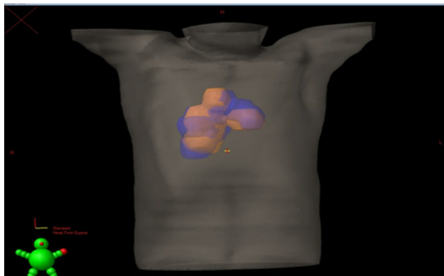
Figure 2. Three dimensional view of PTVs. PTV with blue colour belongs to CT guided delineation. PTV with orange belongs to PET-CT guided delineation. In this patient, PTVpet has a smaller volume than PTVct.

Shervin investigated elective nodal failure as a result of involved field IMRT in 60 limited stage SCLC patients. Only one patient in 30 with recurrence was isolated elective failure (22). In De Ruyssher's study with the use of PET-CT elective nodal failure was 3% (25). In Intergroup 0096 study, 2-year overall and disease-free survival rates were 47% and 29% respectively. Also in RTOG 9311 study failure rate was 8% in NSCLC patients (26). No patients received elective nodal irradiation in our study.