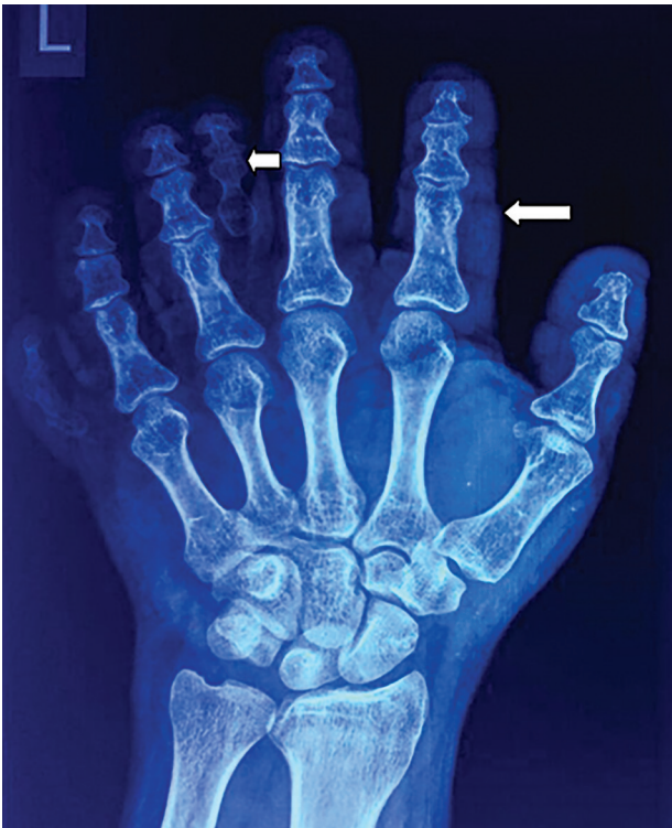
Figure 1. It shows polydactyly, brachydactyly, and syndactyly in the left of the patient (arrows).