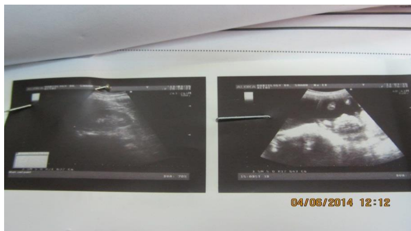
Figure 1. The giant ovarian cyst and pregnancy

The mass measured 50 cm and weighed 10 kg. The pathology report confirmed serous cystadenoma. The patient was discharged in three days in a good condition. A few months later, she gave birth to a healthy newborn weighing 3100 g in the 38 th week of gestation. The 2-year follow-up showed her health status without any disease recurrence.