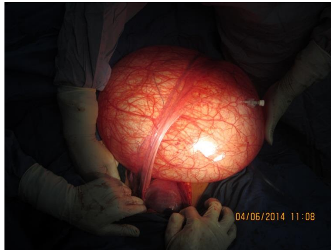
Figure 2. Ovarian multi-cystic mass (10 kg & 45 cm), with an angiocatheter which inserted to evacuate the fluid and decrease the size of cyst