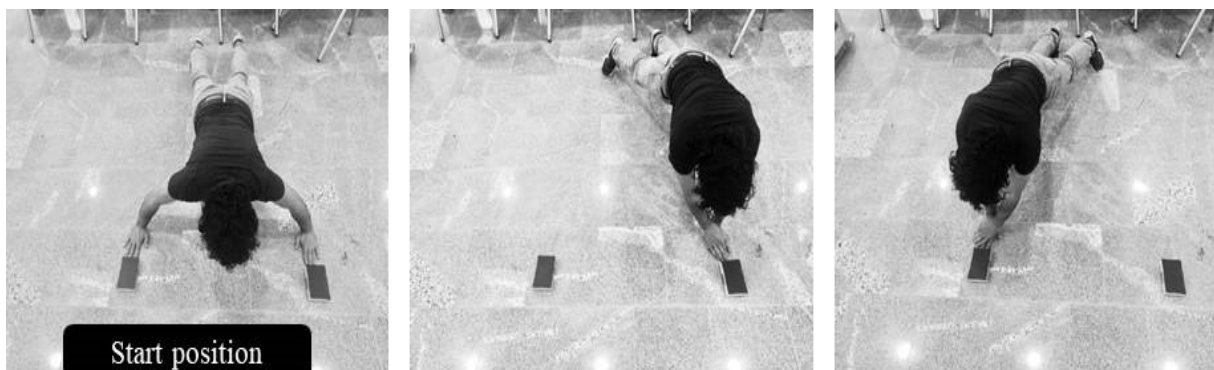
Figure 3. Davis test

Also, to compare the different access scores separately in different directions, these scores were normalized with upper limb length, and normalized access scores for each direction were used for comparison.