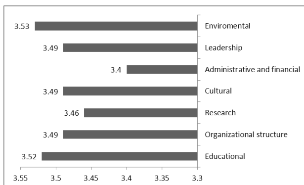
Figure 2. The Mean Scores of Faculty Members’ Attitudes Toward the Components of University Headquarters.

Universities are the origins and sources of development and changes in all countries, especially in developing countries. If the quality of universities is not favorable, the realization of the development plan of that country will be tough concerning the role of higher education (21). The results of the present study represented that medical education in the reviewed universities needed a change (mean = 3.52). This situation implies that medical education should not only be prepared to meet the needs of the community but also should be adapted to the changes in new technologies. However, other studies showed that the educational systems of universities in developed countries have maintained and enhanced their quality by an emphasis on technology, marketing conditions, political and economic conditions, and socio-cultural circumstances (22,23). The reasons for