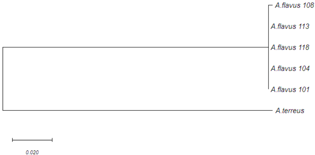
Figure 3. Phylogenetic tree of selected Aspergillus flavus isolates based on analysis of beta-tubulin gene sequences (Neighbor-joining tree model is based on the model of Tamura-Nei. Evolutionary analysis was carried out in MEGA7.)

showed an affinity of more than 65. It was difficult to differentiate these two species given their great similarity. Aspergillus terreus was selected as the outgroup; however, Bt2 was able to split them well (Figure 3).