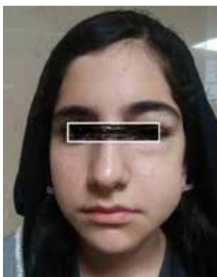
Fig 1. Subcutaneous emphysema on right side of face.

The patient was hospitalized for three nights and her vital signs were continuously monitored during her admission in the hospital. Serum Dextrosaline was given intravenously. Antibiotic therapy first generation Cephalosporin such as Cephazolin one gram IV QID and along with the antiprotozoal drug like Metronidazole 500mg IV TDS were properly administered. The patient was discharged after complete confirmation of no visible signs of swelling and crepitations of the face.