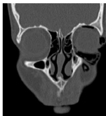
Fig 3. Showing axial and sagittal and coronal cuts showing presence of air in subcutaneous tissues.