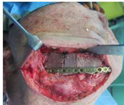
Fig 1. reconstruction of segmental mandibular defect with free iliac graft.