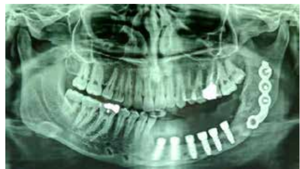
Fig 2. Implants inserted in free iliac graft.