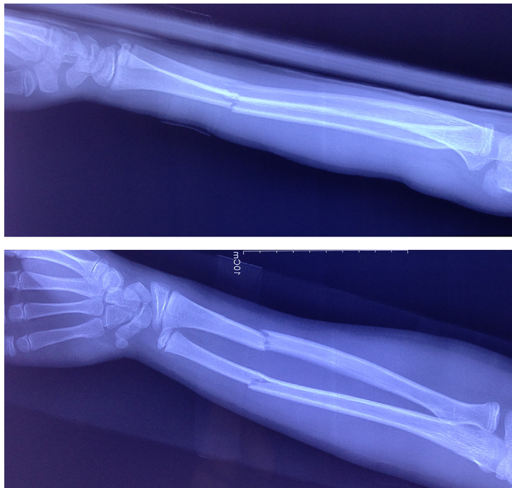
Figure 1. Standard X-ray showing a fracture of radius and ulna in the distal third of the five-year-old child.