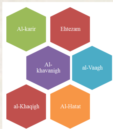
Figure 4. The sound coming out of throat while running

• Al-Ghabe /ghabʕ/ – The sound which is generally heard after the horse neighs from the nose 56, 57 .