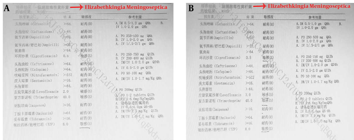
Figure 2. Results of blood cultures on 9 May (the results of four blood cultures on 9 May were consistent, and two times of results were showed here). The results suggested an infection with multi-drug resistant EM. The imipenem MIC was \geq 16 mg/L, with sensitivity to piperacillin tazobactam, levofloxacin, ciprofloxacin, and trimethoprim-sulfamethoxazole.