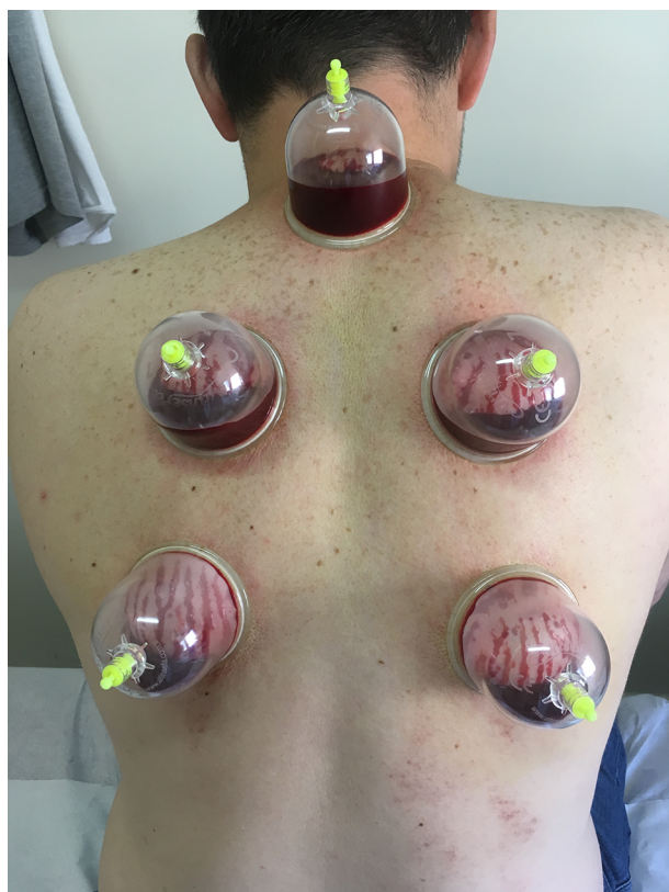
Figure 1. Wet cupping therapy application is shown.

cups were kept on the skin for 3 to 5 minutes. Scarification: Superficial incisions in 2 - 3 mm depth and 3 - 5 mm length were made on the skin using a no.: 11 sterile surgical blade. Secondary sucking and blood withdrawal: The cups were replaced in their former places and kept there until it was filled with capillary blood. At the last step, the cups were removed with their content and disposed of medical waste. Incised sites were covered using sterile sponge pads (6). Following every application, all patients were told to rest for 5 minutes without exception. No adverse effects occurred in any session.