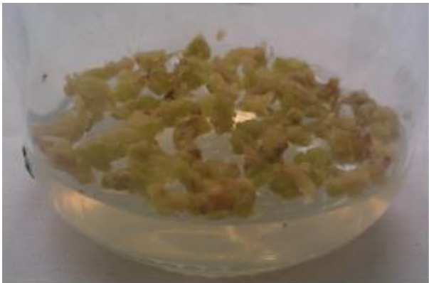
Figure 1. Callus tissue of Lallelantia iberica