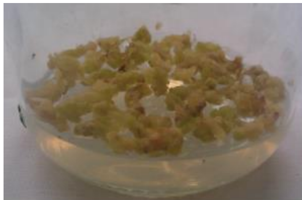
Figure 1. Callus tissue of Lallelantia iberica