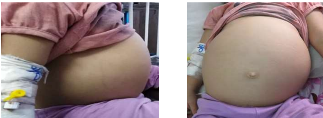
Figure 1. A: The abdominal appearance of the patient (side view). B: The abdominal appearance of the patient (front view)

The cyst was totally excised, and an omentectomy was performed subsequently. After surgery, the patient felt full recovery and was ultimately symptom-free. The histology report also suggests a 9*6*0.8 cm mesenteric cyst to be lymphangioma, with endothelial cell lining and a wall containing lymphatic spaces, lymphoid tissue, and smooth muscle (figure 5). In the subsequent post-operative visits, nothing special was found in the ultrasound and physical exams.