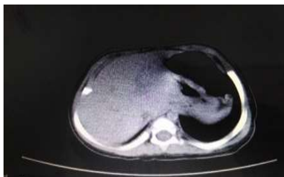
Figure 2. Abdominopelvic CT scan after paracentesis in the previous admission to another hospital