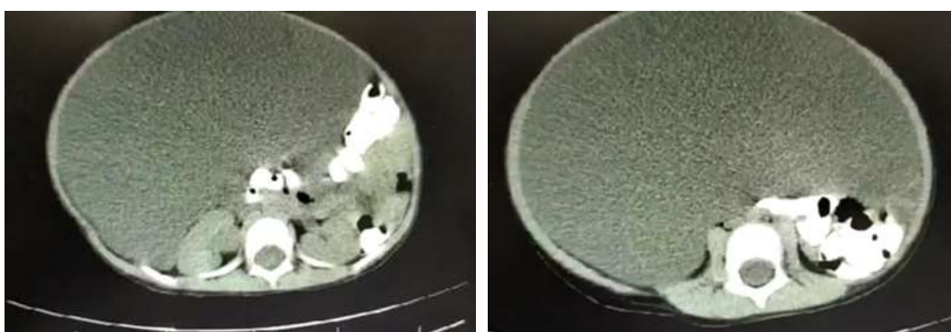
Figure 3. A: CT scan transversal view of the mass (mesenteric cystic lymphangioma). A) The appearance of the lesion. B: CT scan transversal view of the mass (mesenteric cystic lymphangioma). Cystic lesion pulled away from the halo viscous to the left side