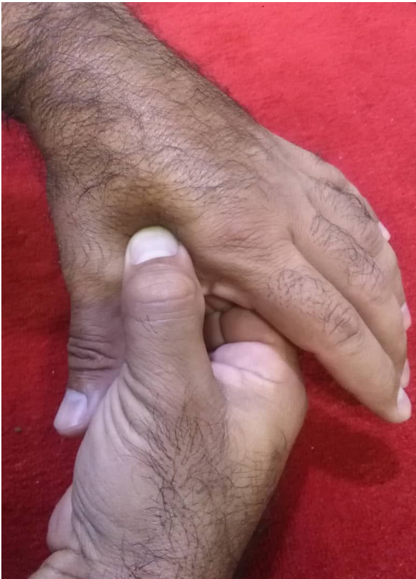
Figure 1. LI4 acupressure point

In addition to pain severity, the frequency of receiving opioid and non-opioid analgesics within the first post-operative day (24 hours) was also evaluated and secondary consequences in both groups were compared.