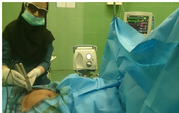
Figure 2. Laser radiation to surgical site

J IR + 1.5 J Red), and the total energy was 27 J.