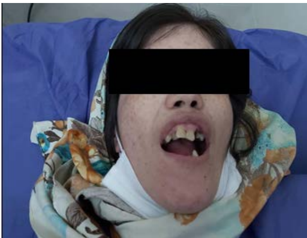
Figure 1. A 32-year-old female with hard palpable mass in the left breast (a) with bilateral varicose veins in lower limbs (b) and freckles on the face (c).

The ultrasonography (US) showed multiple varying size hypoechoic solid and cystic masses (4 cm to 10.5 cm) showing angular, micro-lobulated and spiculated margins and acoustic shadowing with duct extension, branch pattern with thick echogenic halo