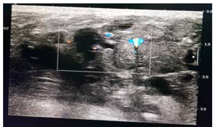
Figure 2. Supersonic ultrasonography images depict solid cystic, irregular and hypoechoic vascular mass (a) with duct extension and twinkling artifact due to calcification (b).