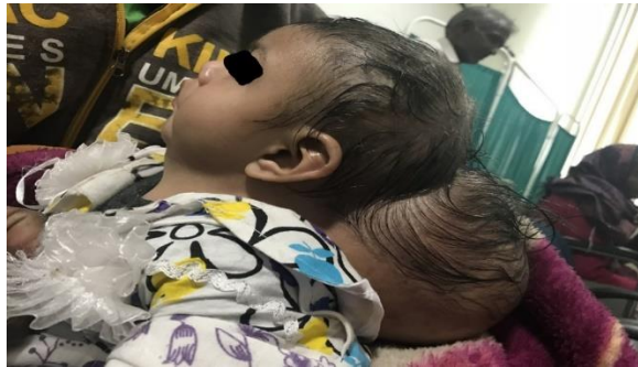
Figure 2- Occipital encephalocele involving posterior elements of the atlas, axis, 3rd and 4th cervical vertebrae.