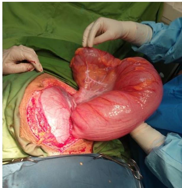
Fig.2: Picture taken during explorative laparotomy, showing dilated sigmoid volvulus on the right side and pregnant uterus on the left side.

around its mesentery near the pregnant uterus was seen; then torsion was opened and there was no evidence of sigmoid gangrene ( Figure.2 ).