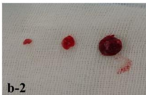
Fig.1: (a-1) The left testis presenting with a mass on the superior pole, delivered via an inguinal section; (a-2) The left testis with the mass, before excision (partial orchiectomy); (b-1) The remaining left testis after excision of the mass (partial orchiectomy); (b-2) The excised mass with the excised surgical margin.