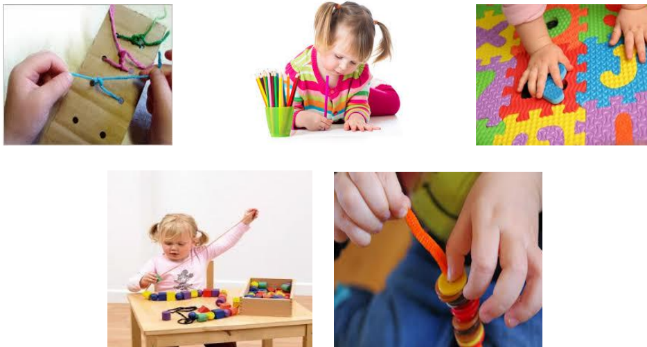
Fig. 1: Exercises of fine motor skills.

At the end of each session, questions were asked on the topics of the same session and the educational pamphlet was given to mothers. Before beginning each session, a checklist of intervention assessment of the previous session was filled out by the mothers ( Table.2 ). It is worth mentioning that the control group received no training