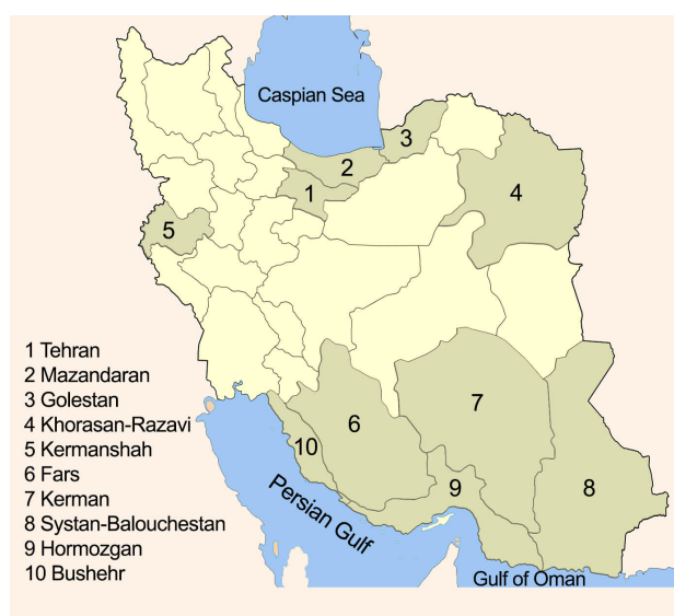
Figure 1. Distribution of the Iran Opium and Cancer (IROPICAN) study sites in different provinces of Iran.

Blood and saliva samples were stored at minus 20 degrees Celsius in each province and shipped to the main center every month (maximum two months after collection) for storage at minus 80 degrees Celsius. DNA extraction was done using the salting-out method at the Cancer Research Center (CRC), Cancer Institute of Iran; extracted DNAs were stored at minus 20 degrees Celsius. These biological samples will be used for several other projects in the future including potential genome-wide association studies in international consortia.