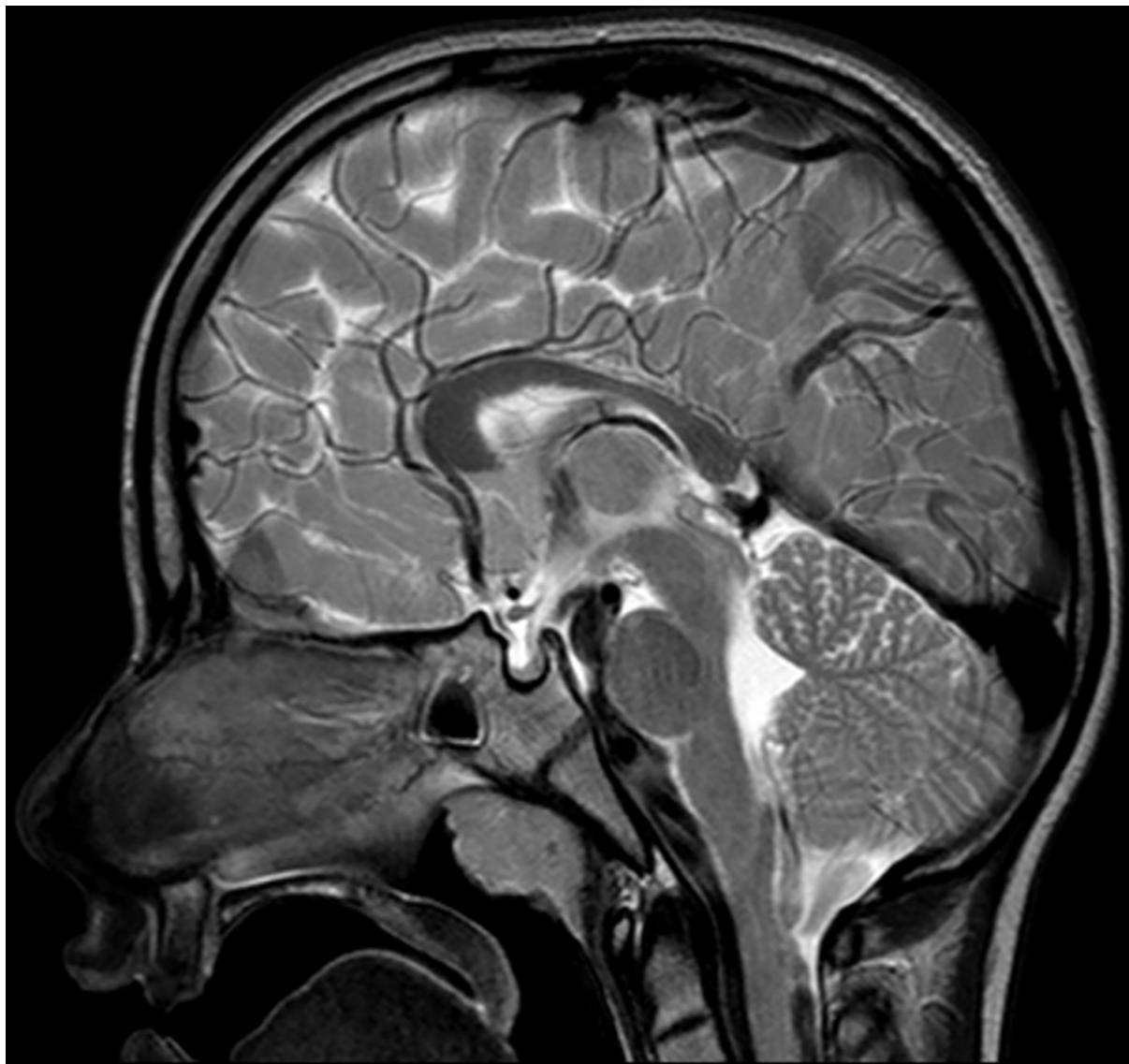
Figure 3. Sagittal MRI showed a mild cerebellar hemisphere hypoplasia

Renpenning syndrome cases with a larger sample size are necessary.