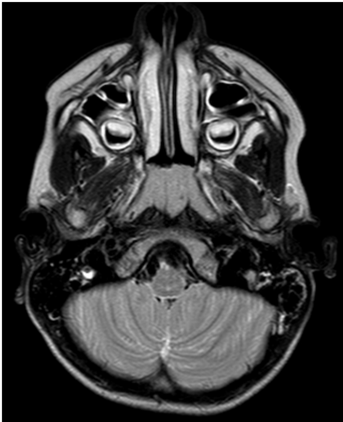
Figure 2. Axial T2W MRI showed a mild right cerebellar hemisphere hypoplasia