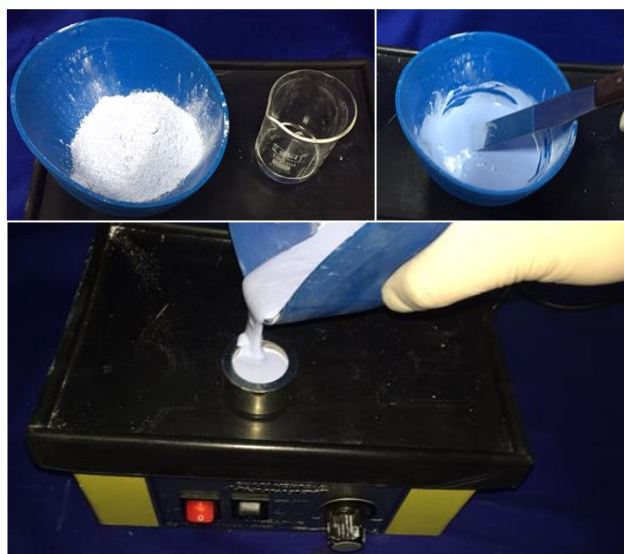
Fig. 2: Pouring the mold with stone

sions stored for zero to seven hours in the same conditions ( P=0.001 ). Also, a significant association was found between dimensional changes following the storage of materials in the refrigerator ( 4^{\circ}\text{C} ) and at room temperature ( 23^{\circ}\text{C} ) for 24 hours ( P<0.01 ; Tables 1 and 2).