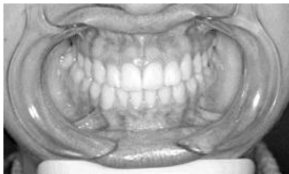
Fig. 1: The patient uses a plastic retractor before scanning

It also facilitates positioning of implant in different locations especially in immediate implant placement [1,5]. A thick tissue biotype plays a significant role in outcome of periodontal therapy [6,7] such as root coverage procedures [6,8,9]. Hence, measuring the thickness of soft tissue and the underlying bone before implant placement is beneficial to prevent complications such as soft tissue recession, implant exposure and consequent psychological problems [1,10]. When required, augmentation can be considered to achieve adequate contours [11].