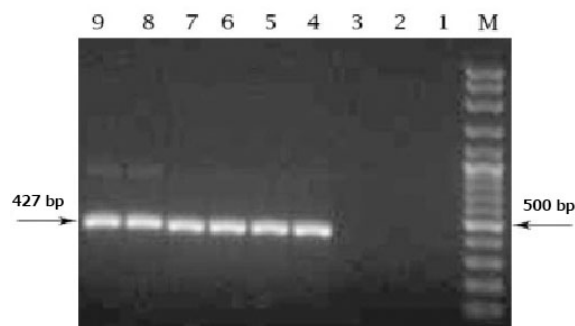
Fig 1. PCR analysis. The 427 bp specific fragment from IS1245 . Lane M, DNA size marker (100 base pair ladder). Lane 1 and 2, negative controls (distilled water). Lane 3, negative species control ( Mycobacterium bovis AN5 strain, ATCC number 35726). Lane 4, positive control ( Mycobacterium avium subsp. avium D4 strain, ATCC number 35713). Lane 5 to 9 samples tested for Mycobacterium avium subsp. avium

In this study IS901 -RFLP typing using Pvu II was successfully conducted on 40 MAA isolates from naturally infected of domestic pigeons ( Columba livia var. domestica ) and produced 7 patterns. The majority of isolates (60%) were RFLP type PI.1 and in comparison this type was the most similar type to standard strain, however all the patterns obtained in this study, were different from the standard strain ( Mycobacterium avium subsp. avium D4 strain, ATCC number 35713). In addition no common pattern between this study and the only another similar study in Tabriz-Iran (which is not published) was found and it indicates that the sources of their infection were not same.