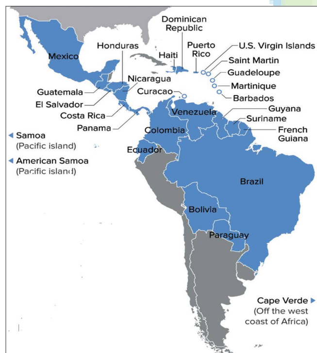
Figure 1: Countries in Americas with locally transmitted Zika virus disease

Beginning October 2015, suspected ZIKVD emerged, and by mid-October 2015, 165 cases were already suspected. The country's first ZIKVD outbreak was confirmed on 21 October 2015. By 6 December 2015, suspected cases of ZIKVD rose to 4744 which further increased to 7081 by mid-January 2016. Neurological complications were however not reported. [12]