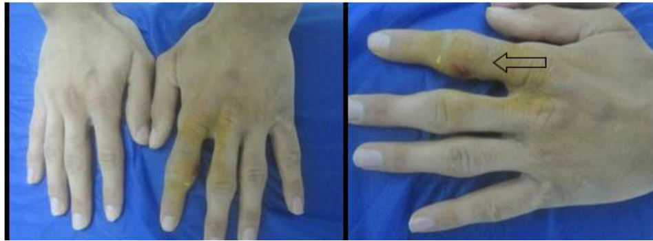
Fig. 1: Left Soft-tissue swelling on the proximal interphalangeal joint of the second through fourth fingers with thickening of the skin Right: Close view

ling without bone or articular abnormalities or space loss. His left-hand span was broader and his left fingers were longer than right ones, and had borderline joint laxity but without any remarkable signs of Ehlers Danlos. Routine laboratory screening, were normal.